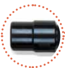
Standard collet for 6 mm grinding pins