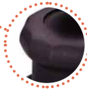
Non-slip, sensitive grip for perfect ergonomics and operation without fatigue