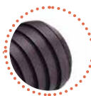
Low-noise and low-vibration with 360° rotating connection for dust extraction and user comfort