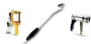
Accessories (f.l.t.r.) Moment insertion nipple Twin plug Lever valve plug