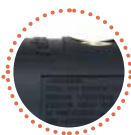
Ergonomic, non-slip, cold-insulated handle and low weight make for optimum handling