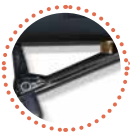
Safety switch to prevent unintentional activation and automatic stop