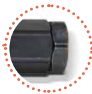
Optimised air discharge through rotatable exhaust ring